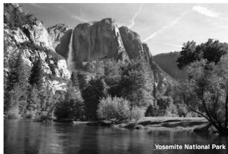
Yosemite National Park; Source: www.playfresno.org

Data Source: U.S. Census Bureau, California Department of Finance, Demographic Research Unit