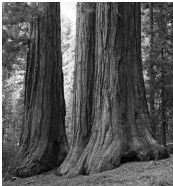
The Giant Sequoias at Kings Canyon National Park